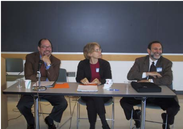
Illinois Sub-Region Presenters:

The Illinois group sponsored a day long workshop that featured three presentations, a discussion among the three presenters, and an interactive engagement with the audience.