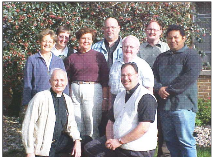
The class of 2003/ 2004

In 2002/2003 participants included a pastoral minister in a hospice program in Ida Grove, IA, a hospice nurse and a parish pastor (Church of Christ) from Storm Lake, a Hispanic minister who serves congregations in Storm Lake, Cherokee, and Estherville, a pastor for the Southeast Asian Church in Storm Lake, and a chaplain from a nursing home in Spencer. The variety in the participants' cultural backgrounds and in the clinical and community settings served made for a rich multicultural experience.