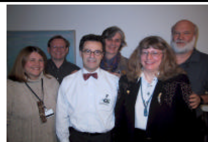
2003 Annual Conference Planners