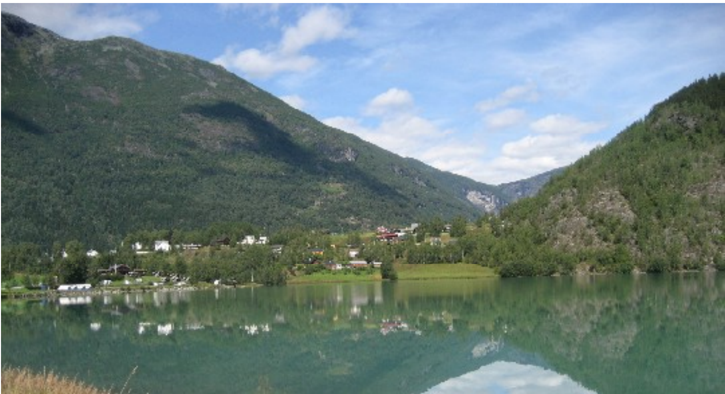
The Sognefjord, Norway

It was shocking and disconcerting to return home and find that it was seemingly impossible to have an intelligent discussion about health care reform and to hear irresponsible politicians spreading lies about the Canadian system and claiming death panels are part of the proposed legislation. Sad to say, the two lead offenders, Representative Michelle Bachman and Senator Charles Grassley, are from states within our Region. How did we manage to elect such bigots to public office?!! We owe the nation and the rest of the world a sincere apology.