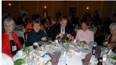
The Presidential Banquet